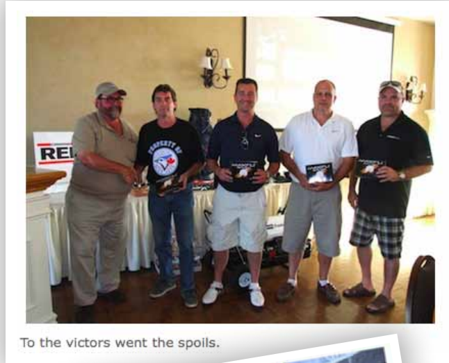
To the victors went the spoils.